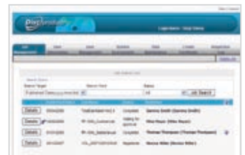
The intuitive “Total Disc Network Administrator” software lets you manage users and their jobs.

The user can take out his published discs from the drawer.